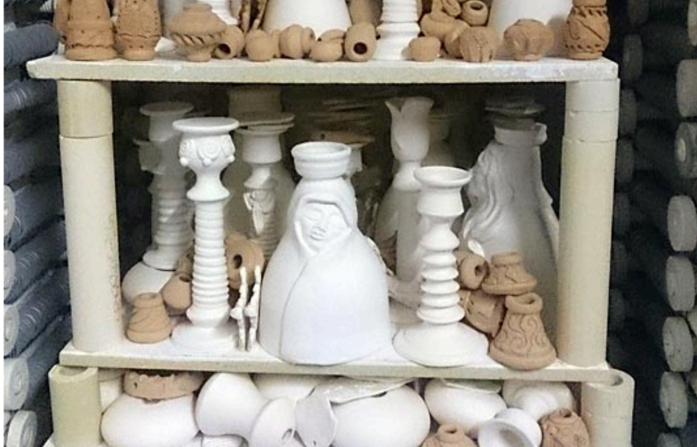
The NRPS offers a firing service with the cost calculated on the fired weight of each piece.