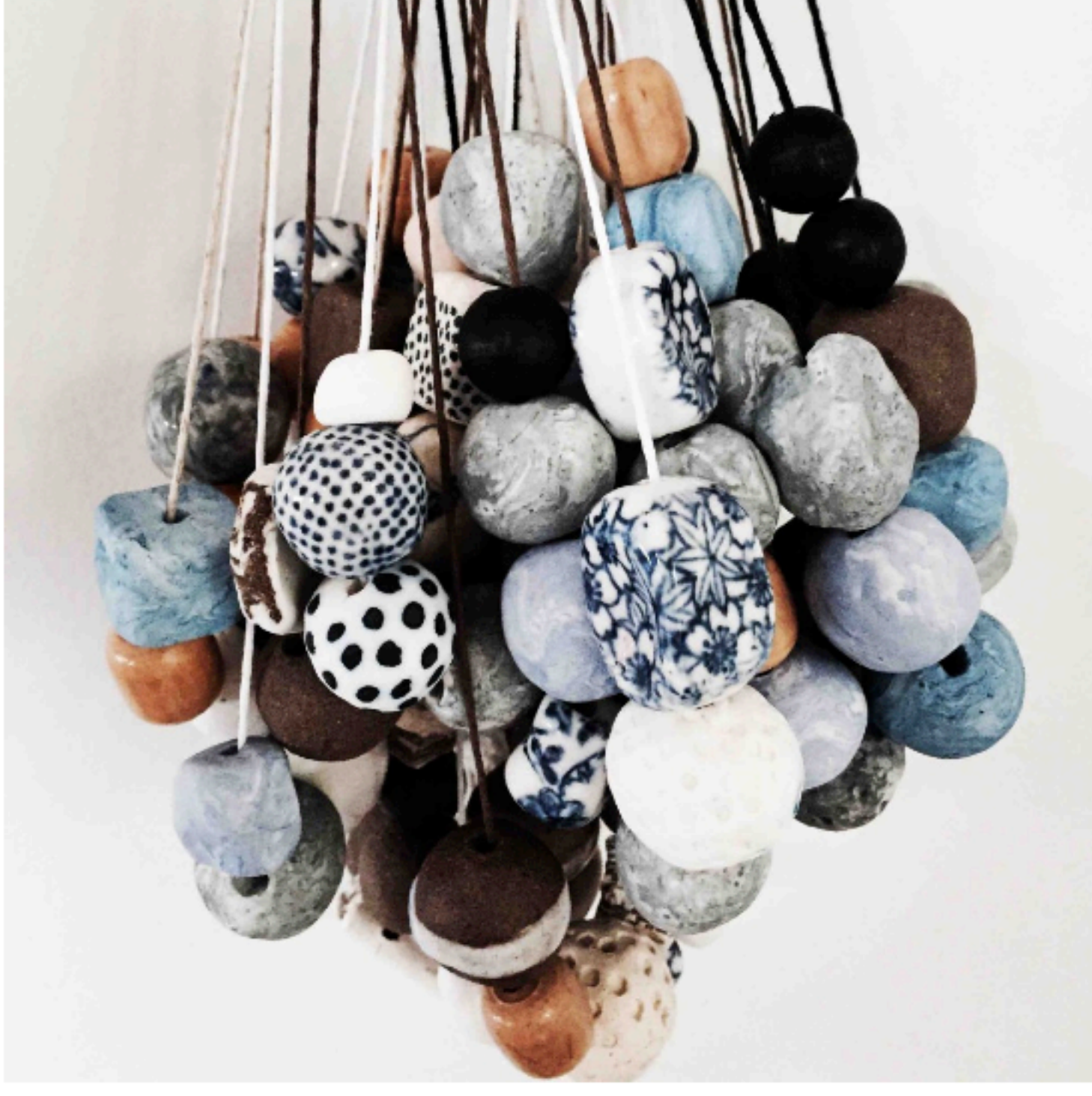
Ceramic beads and bangles give pottery a whole new meaning...